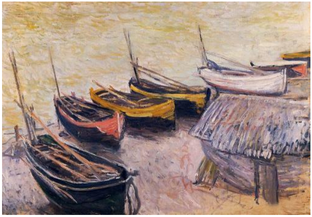
Claude Monet "Boats on the Beach"

Art and Design: Social Science, Volume 02, Issue 03, 2022 E-ISSN: 2181-2918; P-ISSN: 2181-290X black. Here are some examples of Impressionist paintings.