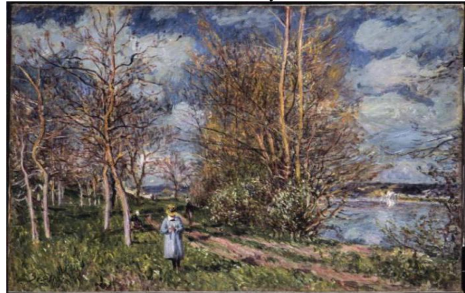
Alfred Sisley: Spring lawns