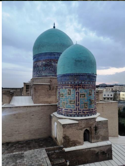
Shahi Zinda Memorial Complex